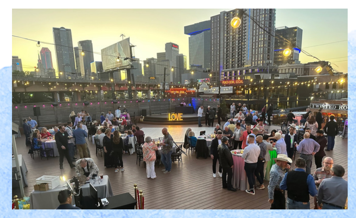
2616 Commerce Event Center - Roof Top